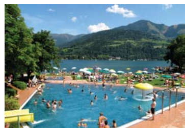
Public pool at Zell am See

This is a superb tour offering quality hotels, leisurely cycling away from traffic, and an enticing range of activities when you're not cycling. Remarkable scenery is guaranteed and ever-present.