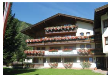
Gasthof Bad Hochmoos, Lofer