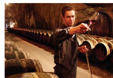
Caves de Monplaisir, Chinon

Bypass the traffic but not France’s ‘Valley of the Kings’ – see the elegant pinnacles of the Château d’Ussé, graceful Azay-le-Rideau, and the Château de Villandry, surrounded by some of the finest formal gardens in France ; admire the magnificent