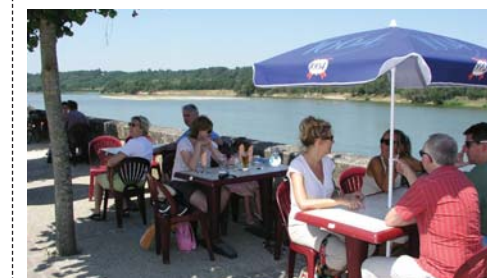
Café by the Loire

Any day 1 May 2010 to 30 September 2010 4 nights: Chinon (2), Azay-le-Rideau (1), Villandry (1) 7 nights: Noyant-de-Touraine (1), Chinon (3), Azay-le-Rideau (2), Villandry (1)