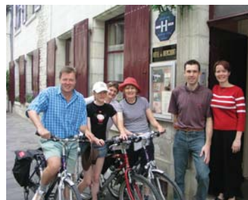
Hotel welcome at Azay