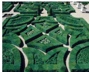
Maze at Villandry