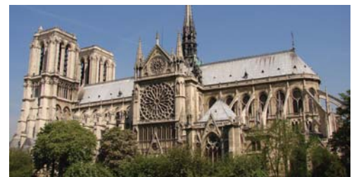
Notre Dame, Paris