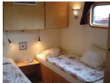
Twin beds (not bunks)