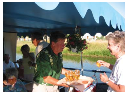
Welcome drink on board

Travel Information Flights to Paris: Available from a wide variety of carriers. Train to Paris: Eurostar from London St.Pancras, Ebbsfleet, or Ashford Transfer Information For holidays starting in Paris: transfer from Paris airport or the Gare du Nord to the Port d’Arsenal in south east Paris. Transfer by train from Montargis back to Paris, Gare de Bercy, 1 hour. For holidays starting in Montargis: transfer by rail from the Gare de Bercy in Paris to Montargis – approx 1 hour and 18 euros.