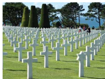
American cemetery Omaha Beach