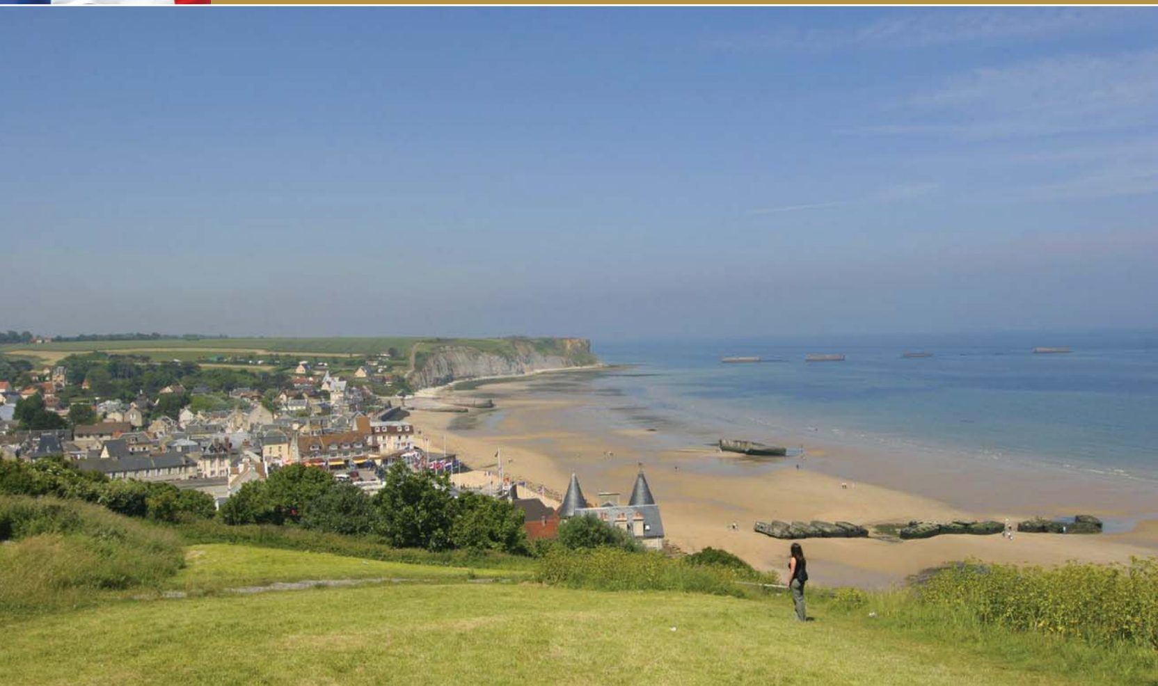
Arranches landing beach