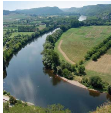
Dordogne from Chateau Beynac