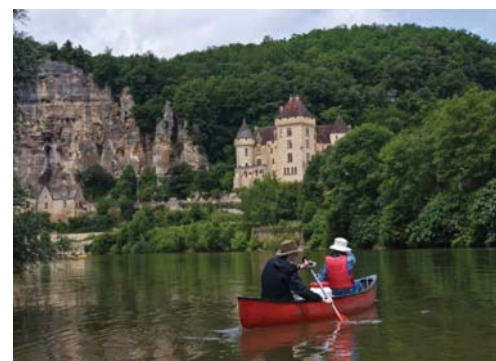
Canoeing the Dordogne

Terrain Mainly on the flat with occasional short hilly stretches. Daily Mileage 17-35 miles (26-56 km) Climate Summer daytime temperatures are in the range 25-35°C (76-95°F) with Spring and Autumn lower at 22-28°C (70-83°F). Rainfall is low with showers more likely outside the Summer months. Evening thunderstorms can occur in high Summer. Travel & Transfer Information Flights to Bergerac, Toulouse or Brive (airport due to open June 2010), then rail to Souillac Flight/rail to Paris then rail to Souillac (4.5 hours) Please ask us for assistance if required in planning your journey.