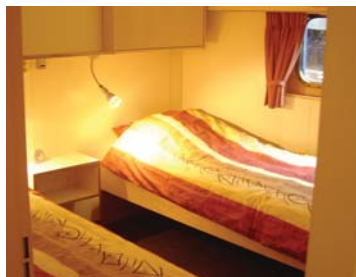
Iris twin cabin