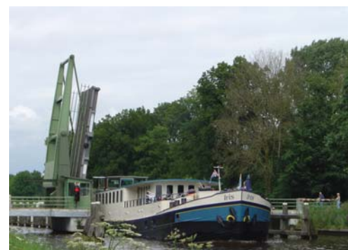
Iris through a lock

After breakfast make your way to your chosen departure point.