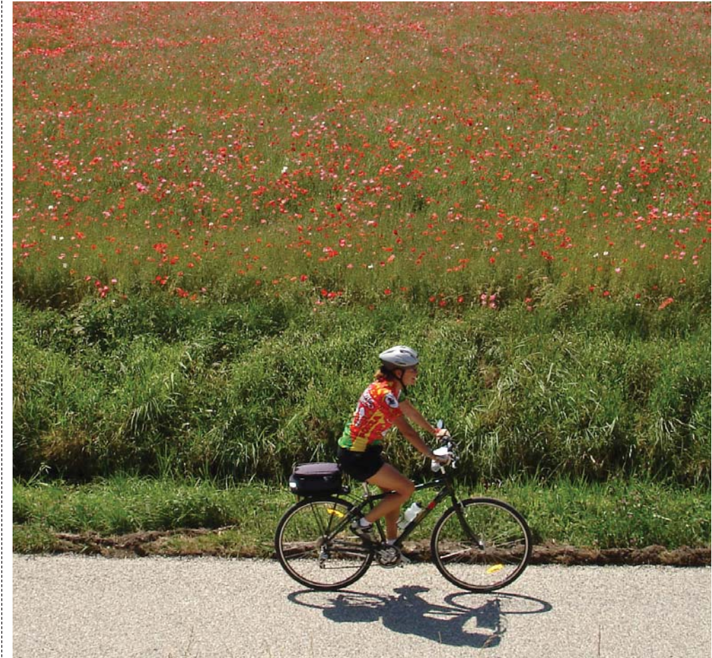
Cycling beside poppy fields