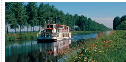
Canal, near Bruges