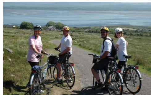
Road with a view, Kerry