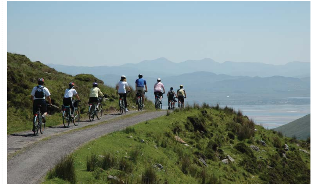
Open road in Kerry