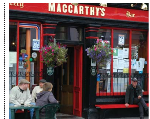
MacCarthy’s Bar, Castletownbere