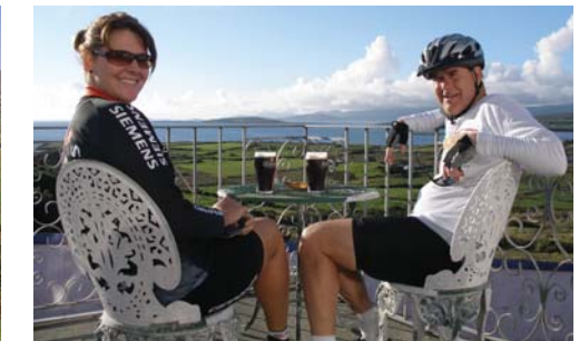
Drink with a view