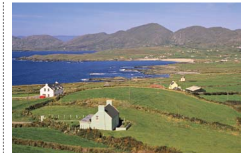
Ballydonegan Bay, Beara