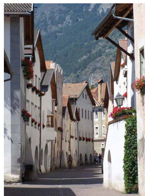
Street scene, Burgeis – Saturday morning rush hour!