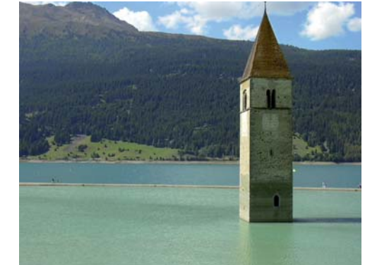
Sunken Church, Caron