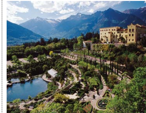
Trauttmansdorff Castle & Gardens, Merano

Depart for your journey home or stay on for extra nights in Verona or Venice.