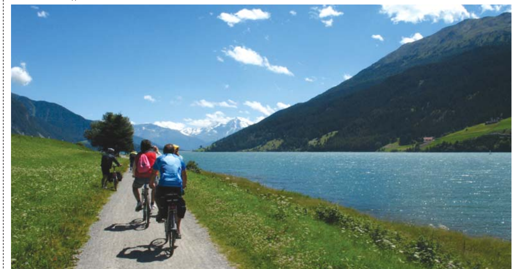
Lago di Resia