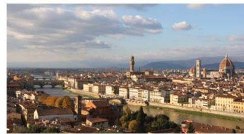
The Florence skyline

Choose your favoured itinerary and consider one or two extra nights to enjoy more of Tuscany.