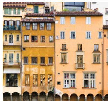
Buildings next to the river Arno, Florence