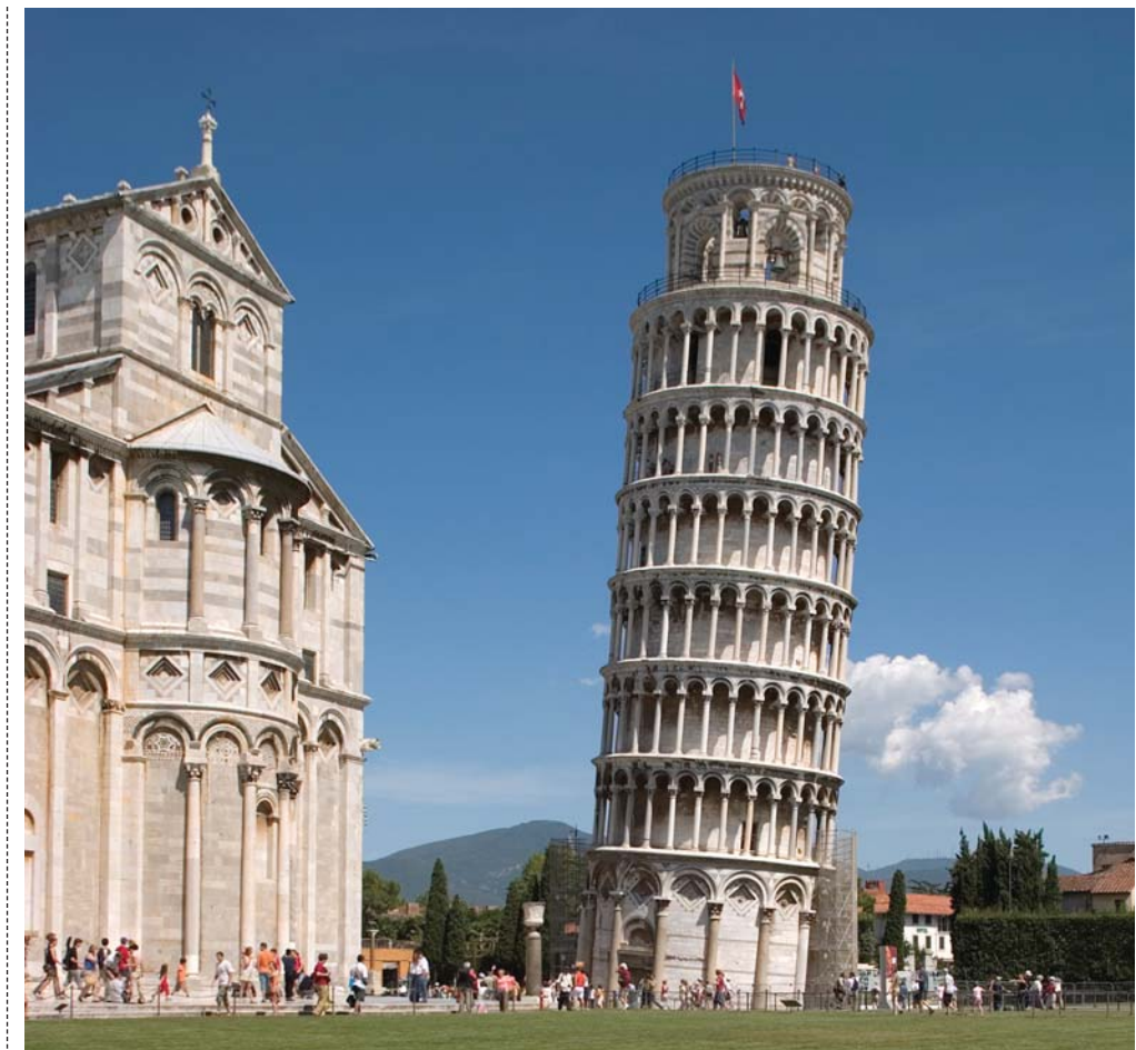
The famous Leaning Tower, Pisa