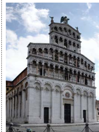
Basilica San Michele, Lucca

Every Saturday 3 April - 23 October 2010