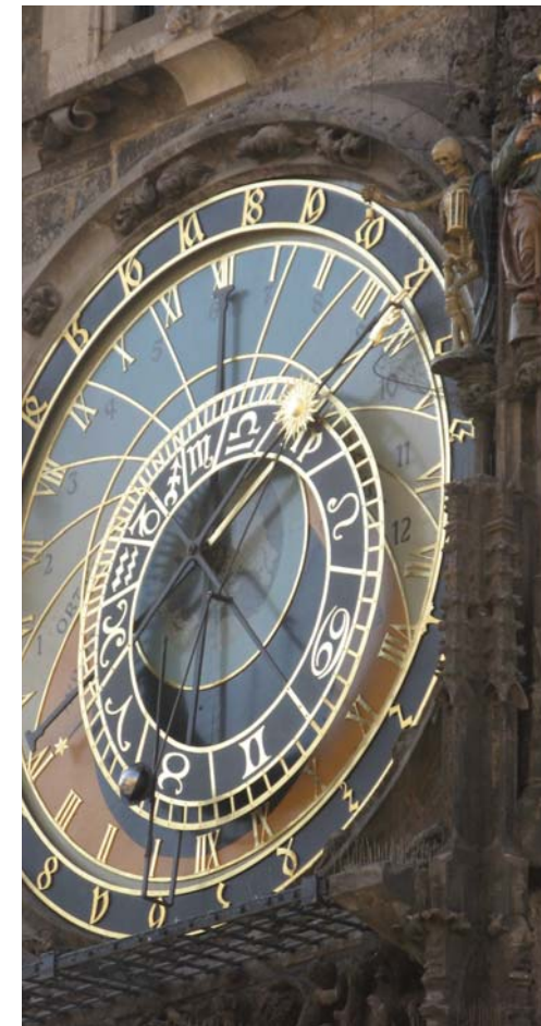
Astronomical clock, Prague