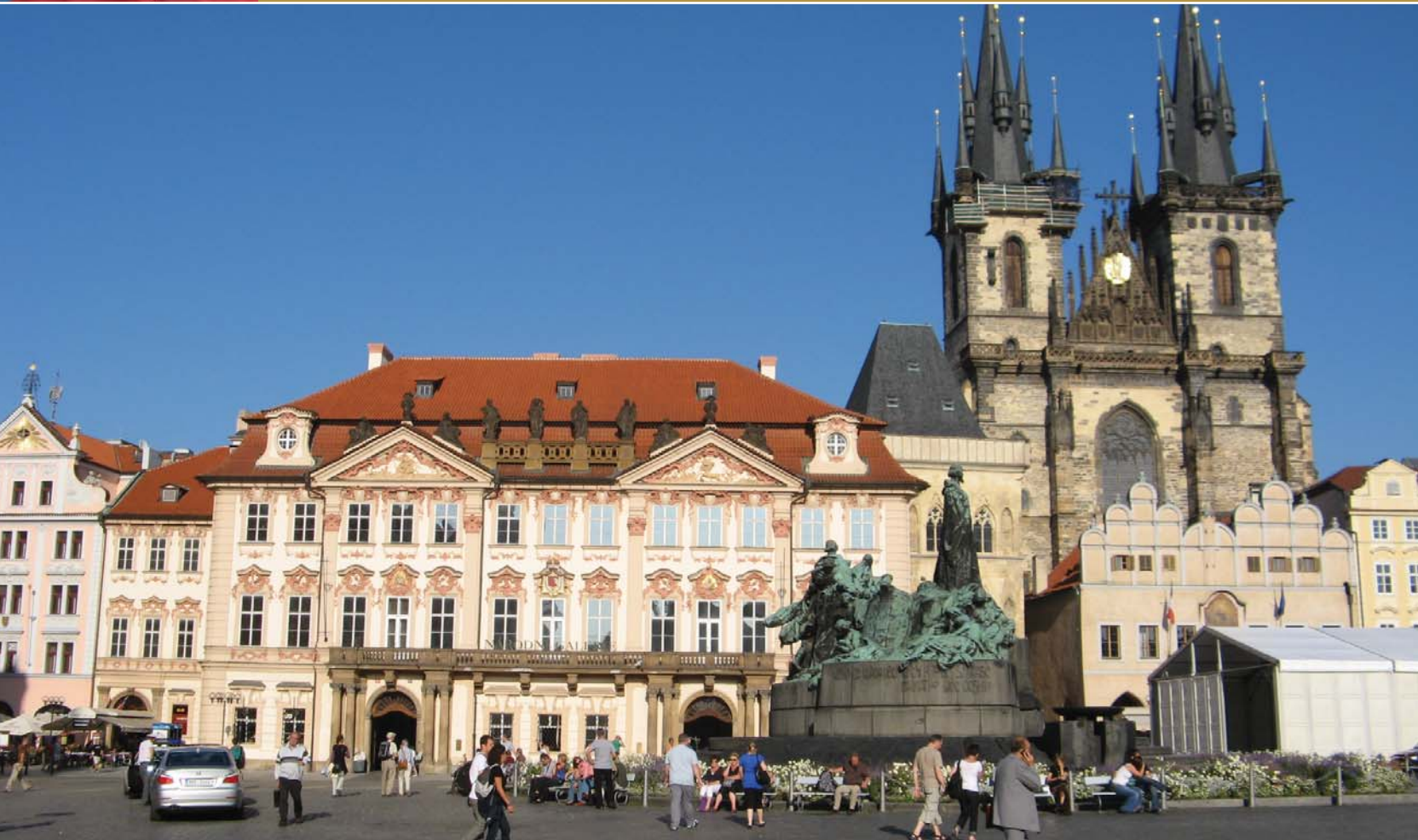
Town Hall Square, Prague