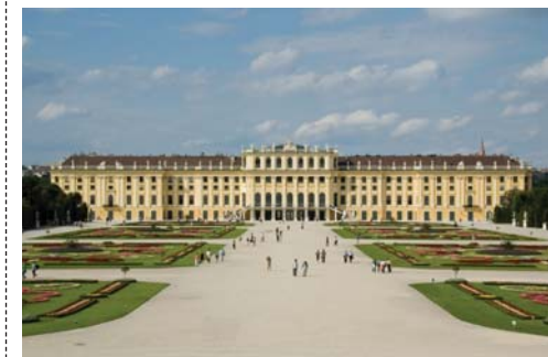
Schonbrunn Palace, Vienna